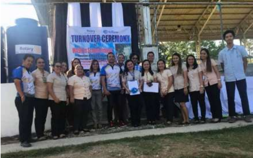
Turn-over ceremony of Rotary Club of Sta. Ana Davao on Wash project at Magtuod National High School