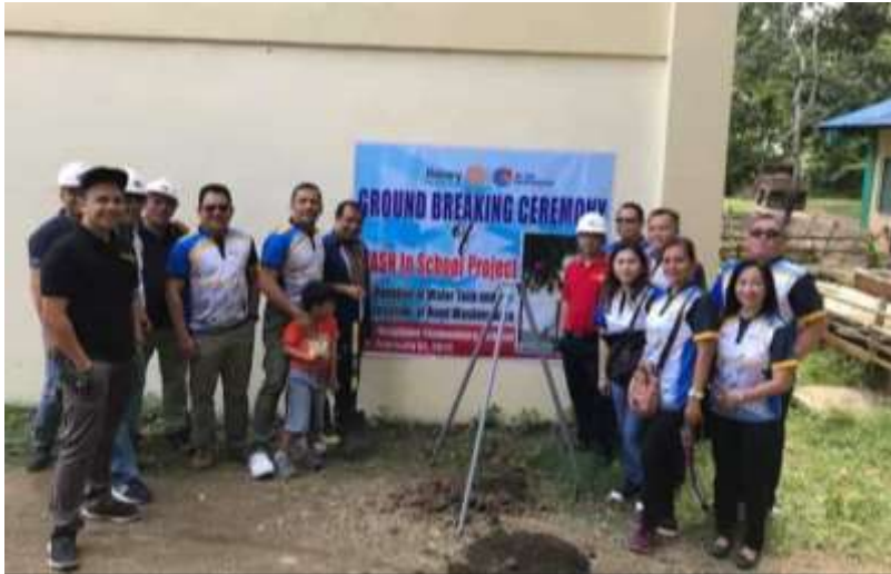
Last February 01,2019 Rotary Club of Sta. Ana Davao Conducts ground breaking ceremony on Wash Project facilities at MagtuodElementary School.